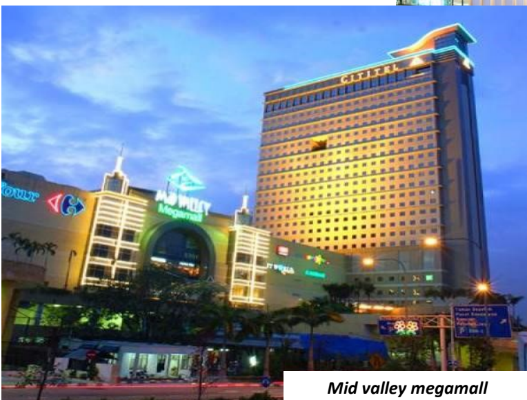
Mid valley megamall