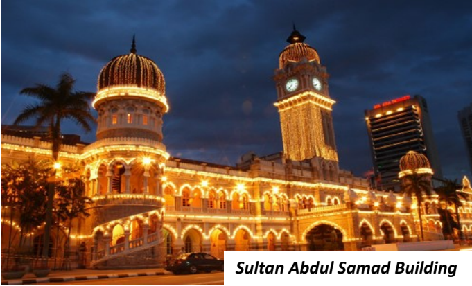
Sultan Abdul Samad Building