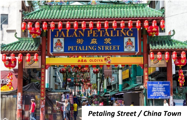
Petaling Street / China Town