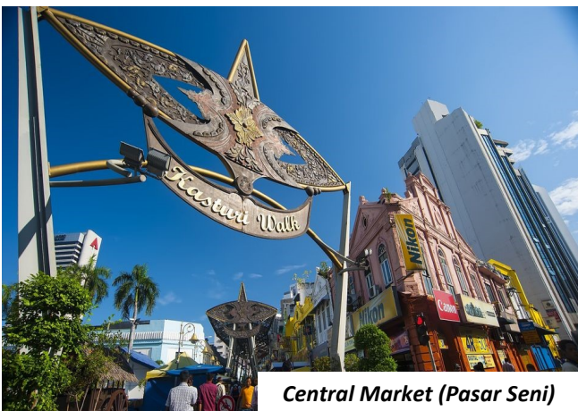
Central Market (Pasar Seni)