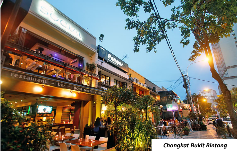
Changkat Bukit Bintang