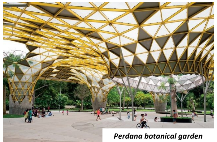
Perdana botanical garden